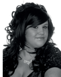
Saturday 26th November Pop, Rock & Soul Band