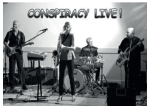
Saturday 5th November Four Piece Band