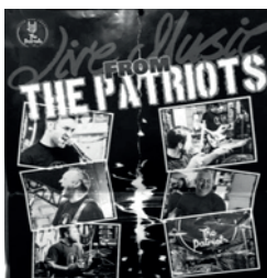
Saturday 12th November Yorkshire Group The 'PATRIOTS'